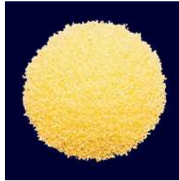
medium and fine